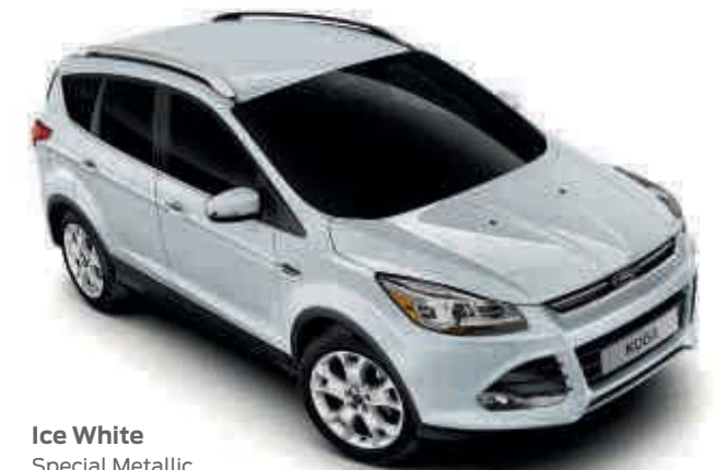
Ice White Special Metallic body colour*

Please refer to http://www.ford-mobile-connectivity.com/ for information regarding Bluetooth® mobile phone / portable music player compatibility