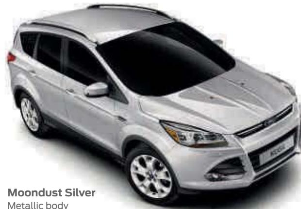
Moondust Silver Metallic body colour*