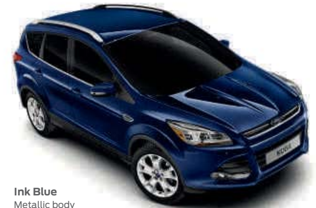
Ink Blue Metallic body colour*