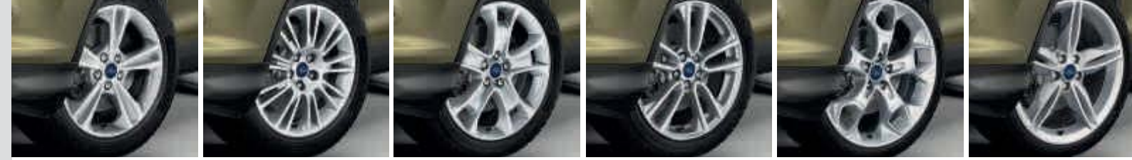
17" 5-spoke alloy wheel (standard on Zetec)

However you personalise your new Ford Kuga, it's a great way to explore your world.