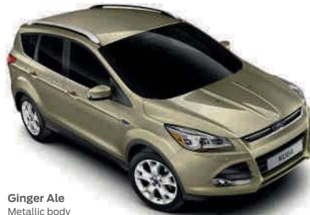
Ginger Ale Metallic body colour*