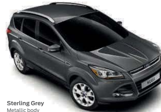
Sterling Grey Metallic body colour*