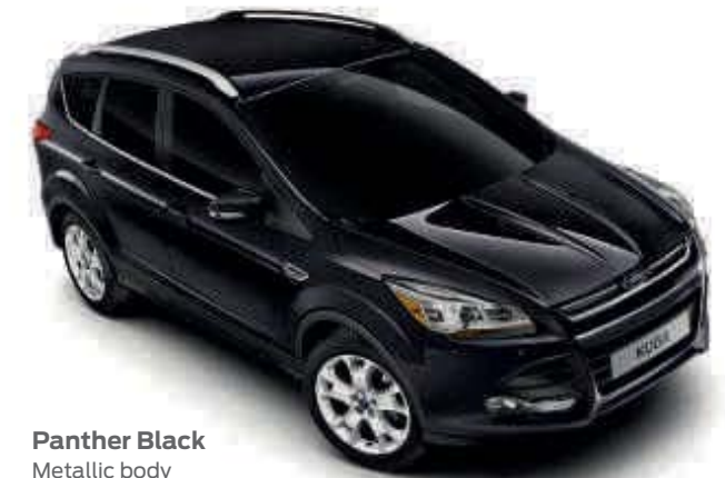
Panther Black Metallic body colour*