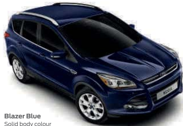
Blazer Blue Solid body colour