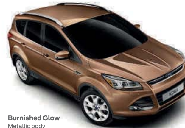
Burnished Glow Metallic body colour*