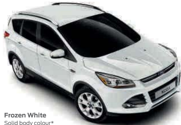
Frozen White Solid body colour*